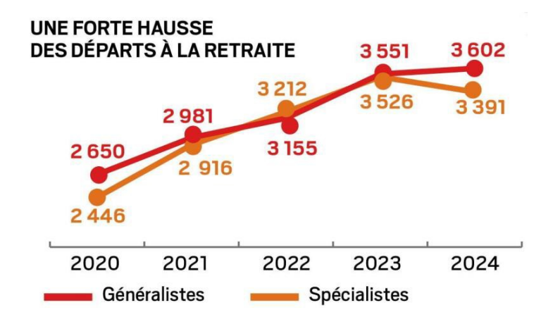
Source: Le Journal du dimanche, "Voici la carte des déserts médicaux", May 5, 2019, by Emmanuelle SOUFFI

Worse still, these difficulties seem to be increasing. Indeed, the DREES has shown that in 2018, 3.8 million French people lived in an area under-equipped in general practitioners. This is 1.3 million more than in 2014 (2.5 million)! This reflects a growing mismatch between the supply and demand for care. There are many explanations for this. Medical time is decreasing due to the overall decline in the number of active physicians due to the retirement of generations of physicians from the high numbers of doctors from the 1970s to 1980s. The suppression of the numerus clausus is still far too recent to be able to compensate for these difficulties in view of the time required to train future doctors. Today, one out of every two general practitioners is at least 60 years old. Retirements have been multiplied by a factor of 6 over the last decade alone. In 2024, nearly 7,000 general practitioners or specialists are expected to retire, only accentuating the difficulties already observed.